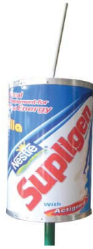
Supligen Can: 22" h x 15" diameter Straw: 12" h