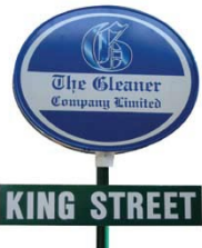
Gleaner 27" w x 21" h x 4.5" d