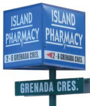
Island Pharmacy 27" w x 27" h x 27" d (3 Faces)