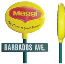
Maggi 24" w x 20" h x 3" d