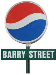
Pepsi 20" w x 20" h x 4.5" d