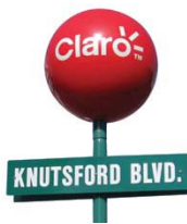
Claro 18" diameter sphere