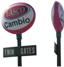
Lasco Cambio 24" w x 18" h x 7" d